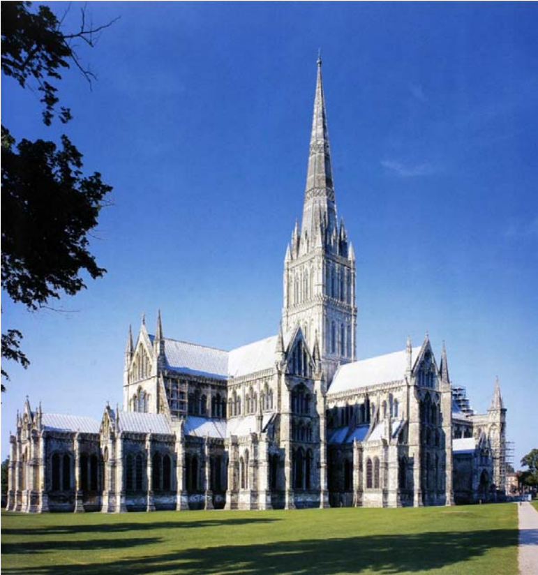
Salisbury cathedral, back view