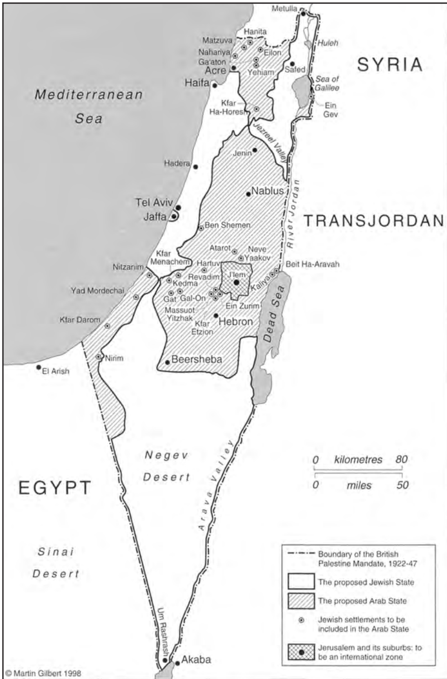
UN Partition Plan, 1947