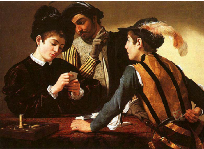
"The Cardsharps," c. 1594, by Michelangelo Merisi da Caravaggio

The securitizers also come under pressure to bring the devalued CDOs onto their own balance sheets, even though they're nominally carried only on the SPVs' books. They may have offered some kind of guarantee in connection with the deals they made, or they may experience reputational pressure to stand behind the securities they sold even if they don't have a strict legal obligation to do so. As a result, their financial position is weakened further.