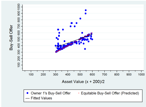
Figure 1: IO